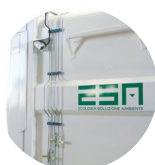
Position sensors, encoders, solar cells, laser, solenoid valves.