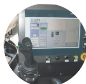
Joystick control and main electronic panel.