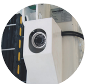
7 monitoring cameras.